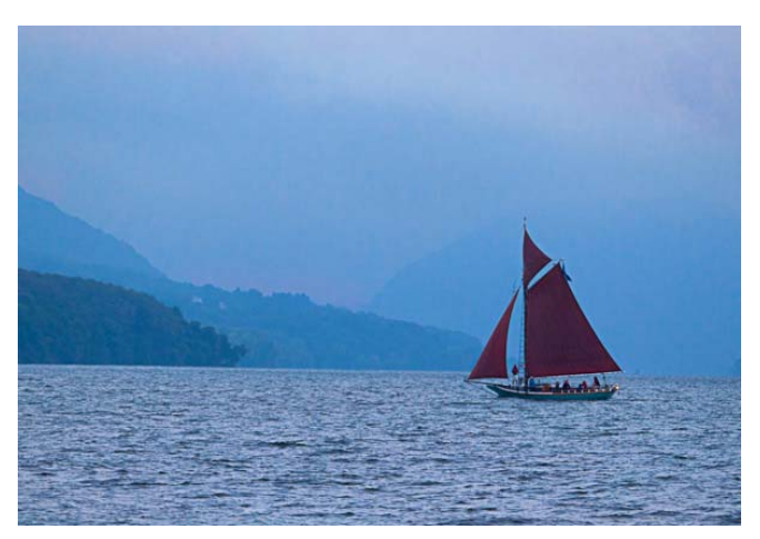
Sunset on another sailing season Tuesday night sail at dusk off of Denning's Point

Finally, gracias to all Woody crew and captains for their hard work this sailing season. Thanks for inspiring the rest of us with your good deeds and deep concern for the environment, our mission, and the community.