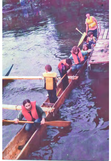
The great dugout canoe launch