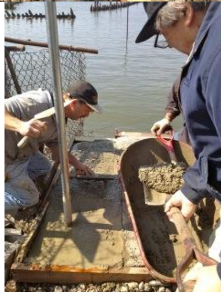
Fence and Ramp Repair