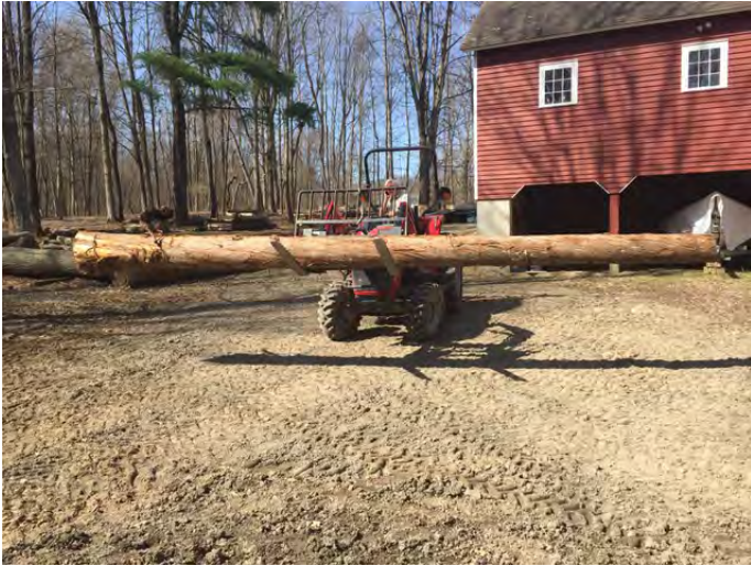
White Cedar Logs From Maine