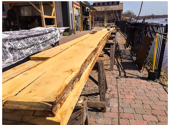
Rough Cut Planks ready for final sizing