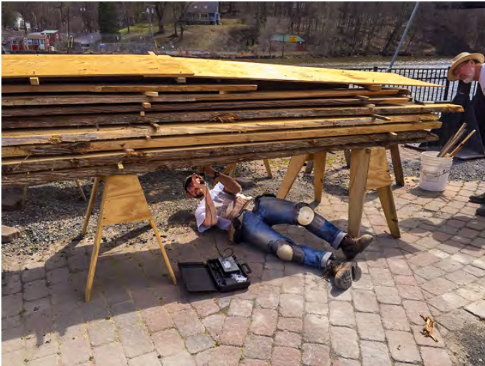
Monitoring Moisture Content