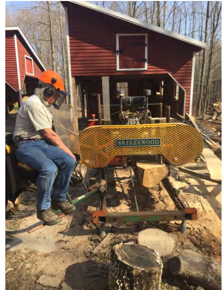
Milled by Jack Weeks