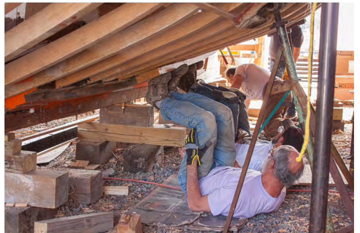
Human clamps hold a freshly steamed plank in position