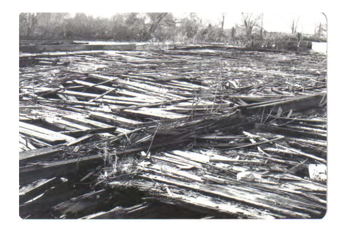
The waterfront as we found it.

We would like to thank the mayor and city council for their support and recognition and look forward to working with them on building a sustainable future for the Hudson River and our community.