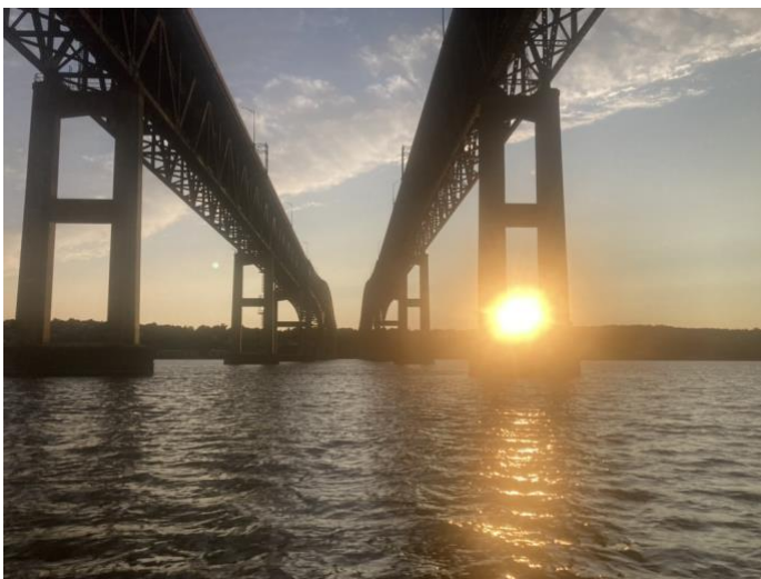
Between the spans on the Woody Guthrie

We are currently planning to host the crew when they pass through Beacon.