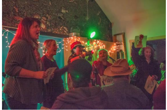
Sunday Dec. 20 5:00 pm – 8pm At the Virtual Sloop Club

<u>https://zoom.us/meeting/86833659205</u> Meeting ID: 868 3365 9205 (US) +1 301-715-8592 Passcode: 381748