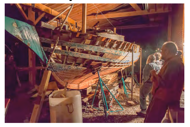
"Candlelight" Tours at Clearwater's Open Boat

The first phase to the project came to a close in mid-November as the shipwrights shifted their focus to the Clearwater. There is much work and fundraising ahead but I think all involved would agree that we've exceeded all expectations in terms of work accomplished and teamwork. The club has earned immense respect for the skills and dedication of our volunteers.