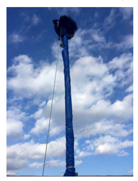
Captain Steve Aloft

http://www.poughkeepsiejournal.com/story/news/2017/12/14/new-york-sue-epa-if-hudson-river-cleanup-deemed-complete/953629001/