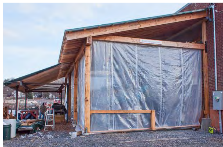
New Greenhouse Sides in Place