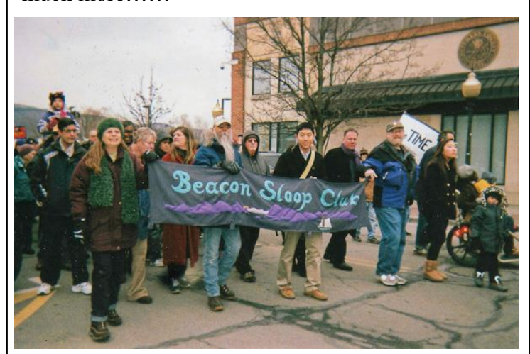
The Sloop Club came out in force for last year's MLK Day Parade