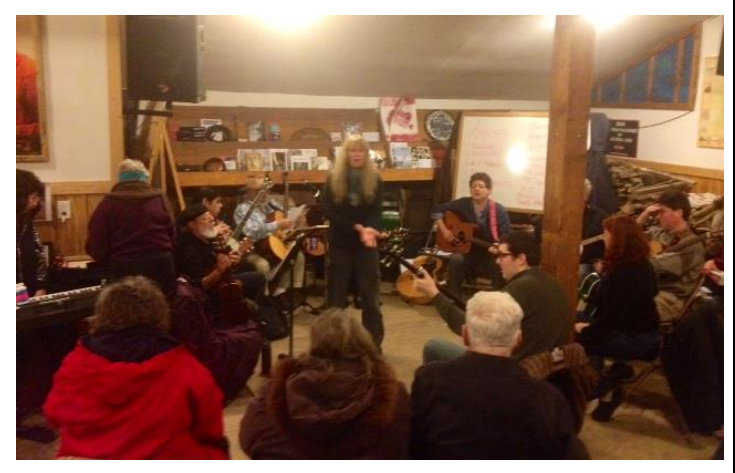
Rehearsal at the Sloop Club

NEXT EXEC. COM. MEETING IS Tuesday, January 27th 7:00 p.m. NEXT MEMBERSHIP MEETING IS FRIDAY, February 6th 7:30 p.m., Potluck at 6:30