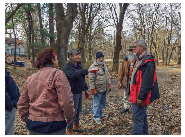
Volunteers preparing our new space