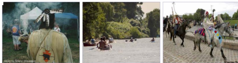
THE BEACON TWO ROW WAMPUM FESTIVAL WILL BE A HISTORIC CELEBRATION OF THE TWO ROW WAMPUM CAMPAIGN