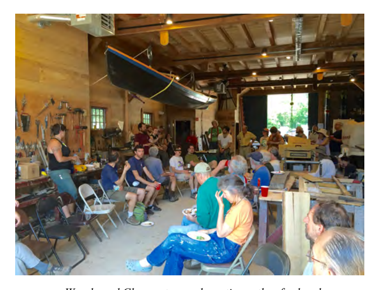
Woody and Clearwater work parties gather for lunch

3 p.m. Public Statement Hearing 6 p.m. Information Session 7 p.m. Public Statement Hearing