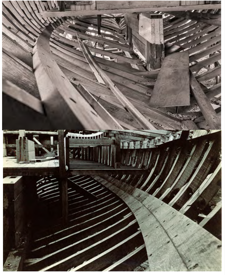
Top photo- Woody Restoration, Below Emilio Rodriguez photo of original build 1977