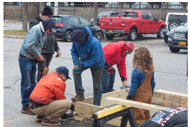
Riversweep

NEXT EXEC. COM. MEETING TUESDAY., May 22, 7:00 p.m.