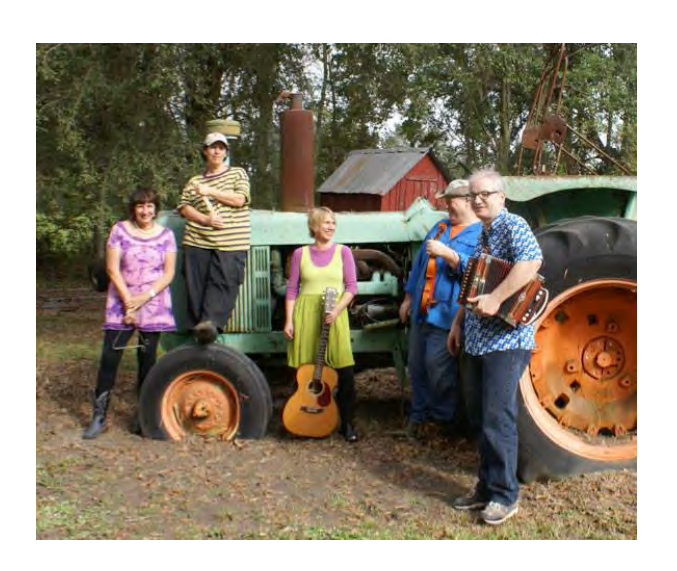
CAJUN HOLIDAY DANCE PARTY with Krewe de la Rue. Sun., Dec 6, 3-7pm

FOR MORE INFORMATION CONTACT AARON @ 914-503-6227