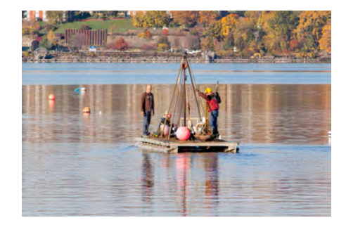
The Final Harbor work party will be Sat. 11/21 at 8:00 am

On this Veteran's Day we would like to salute and honor all of our members who have served in the armed forces.