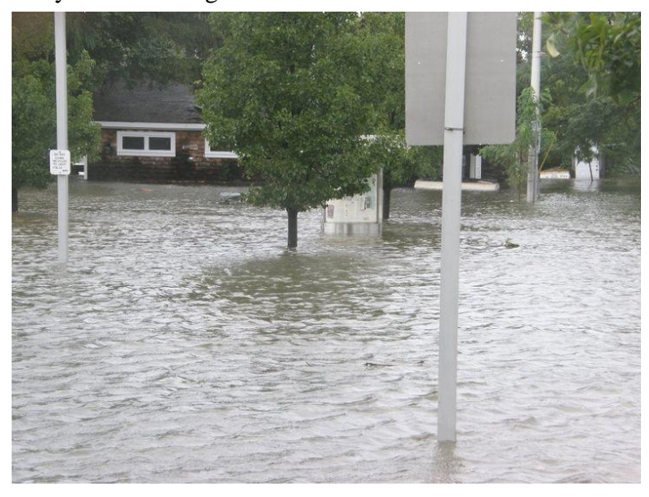
Storm photos by Tom and Aimee LaBarr

Once the storm was over, many volunteers came to scrub off the mud inside the club and to straighten out the docks, pick up errant objects, collect garbage and make repairs. The box on the charging dock was flooded, so between Wally Cox and Rich Holzman, the receptacles were replaced so our sailing program was not interrupted. The docks were straightened out by a nice combination of BSC members, sailors, and harbor folks, although the flooding après the storm continued at high tide all week; as a result, our pontoon boat dock has been floating on top of the pilings and getting stuck on a regular basis, so Kip had the pontoon boat moved to Henry's old mooring in the harbor.