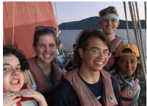
Clearwater crew members on the Woody