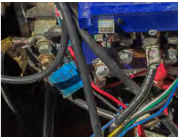
Before the cleanup